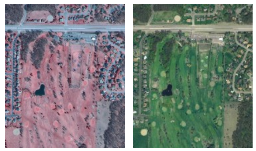
A side-by-side comparison of a Color Infrared and a "true color" image of the same area.

Traditionally, CIR imagery has been used the most in natural resources applications because of its ability to "see" the health of vegetation. The NIR wavelengths of light are reflected most abundantly by healthy green vegetation. As vegetation health decreases, the CIR film is able to detect those changes long before a human eye would be able to see them.