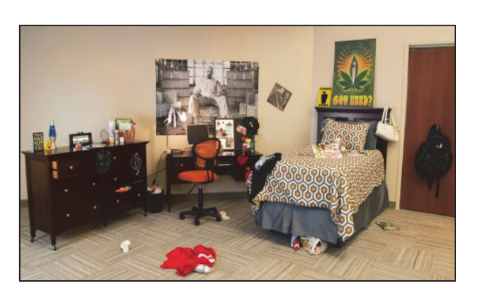
Photo of The Top Secret Project: Decoding the Mysteries of the Teen Domain display

Over 2,000 students, parents, professionals and community members attended crime prevention programs sponsored by the Dakota County Attorney's Office on topics such as online safety, anti-bullying, chemical health, sex trafficking, and mental illness. The Office worked closely with School Resource Officers and the Safe and Drug Free School Coordinators to increase overall awareness related to working with other cultures. The Office also collaborated with the Dakota County Sheriff to present The Top Secret Project , a unique traveling exhibit designed to help parents recognize unfamiliar hazards that are often in plain sight. The interactive exhibit includes hundreds of items that, when seen through an educated lens, could be a sign of a problem.