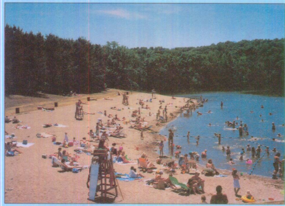
Swimming at Schultz Lake Beach is one of many popular activities in Lebanon Hills Regional Park.