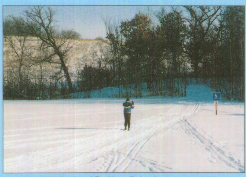
Lebanon Hills Regional Park's trails beckon cross country skiers.