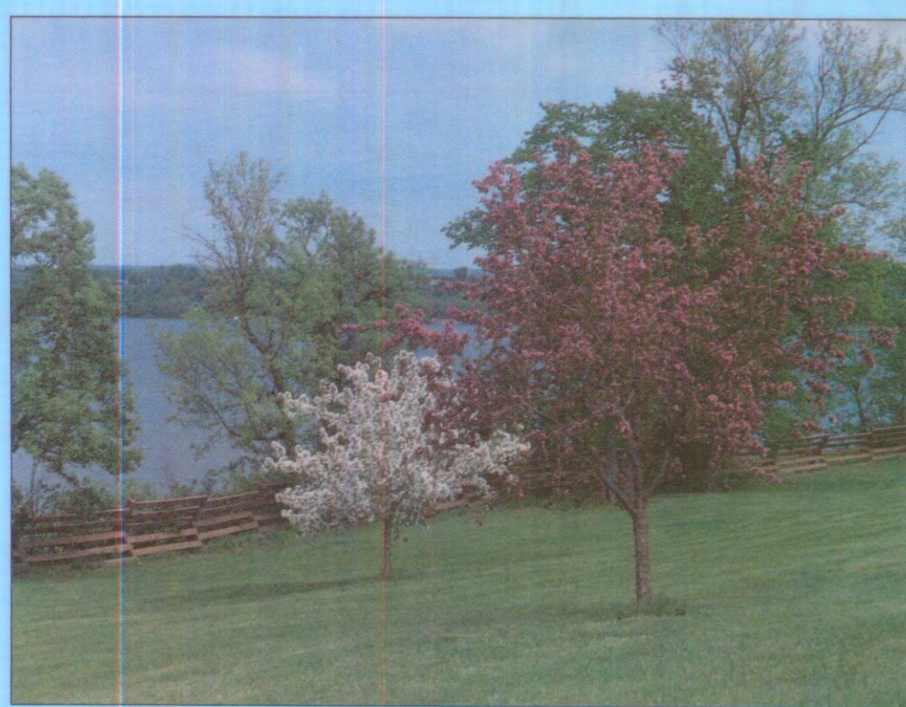
Flowering crab trees add to the appealing vistas at Spring Lake Park Reserve near Hastings.