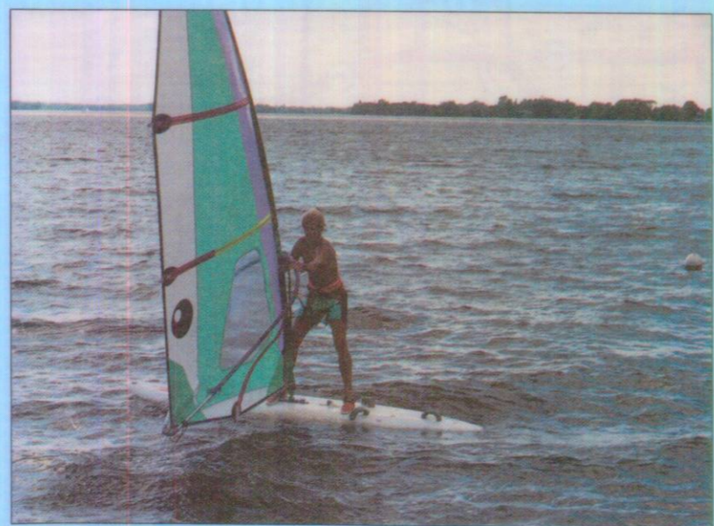
Water sports of all types are popular diversions for visitors to Lake Byllesby Regional Park.