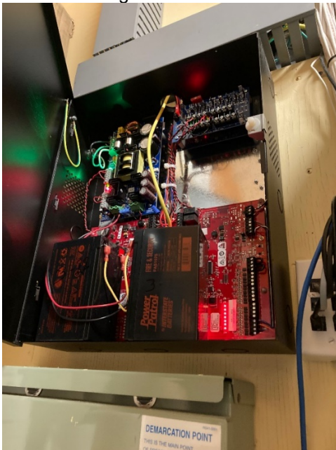
Figure 1 - TCP Existing Access Panel