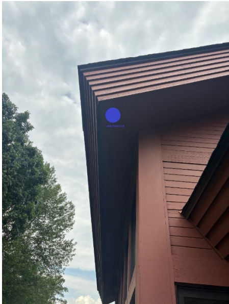
Figure 3 - Axis P3267-LVE Location 1