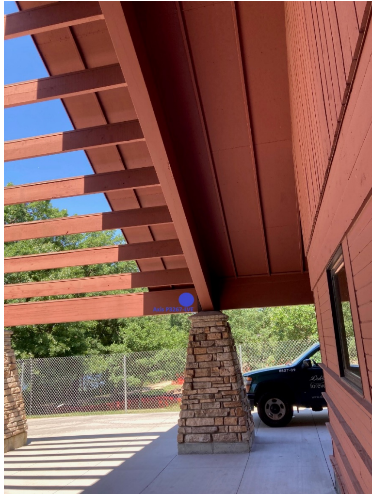
Figure 5 – Axis P3267-LVE Location 3