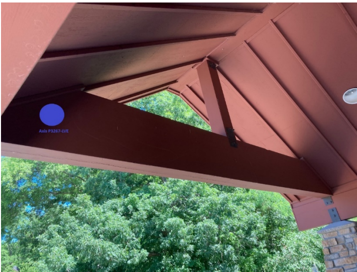
Figure 4 - Axis P3267-LVE Location 2