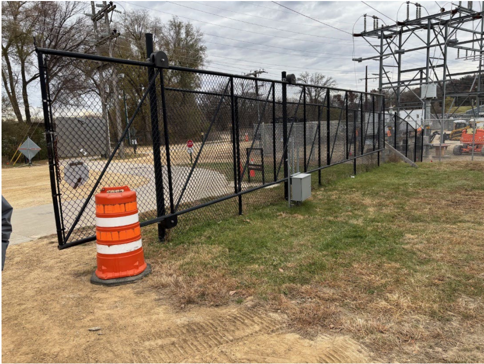
Figure 2 - Onsite Gate and Control Box