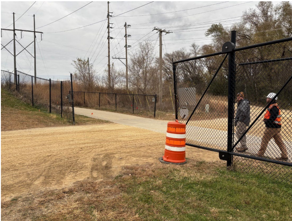
Figure 3 - Onsite Gate Showing Closing Direction