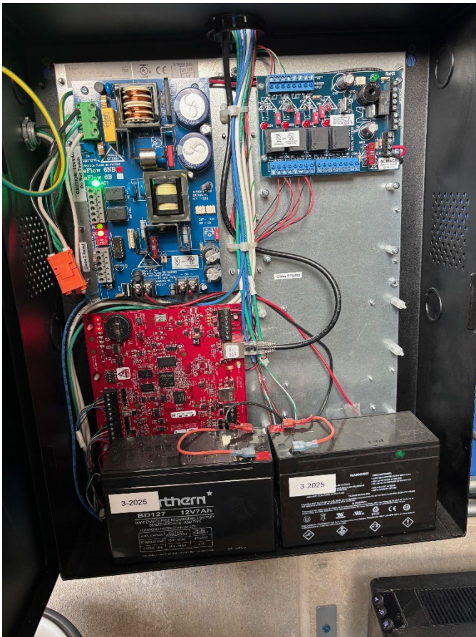
Figure 4 – Lake Byllesby Dam Access Panels