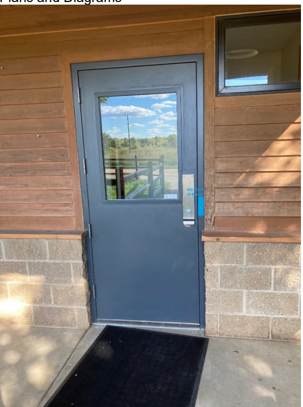
Figure 1 - Main Entry Door Showing Reader Location