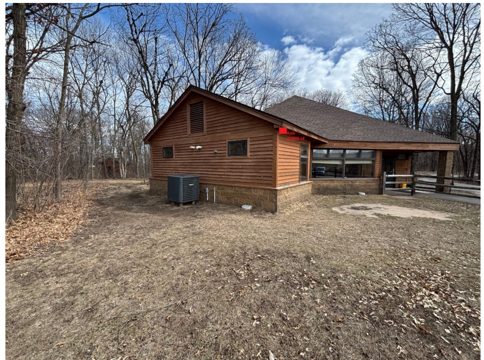
Figure 3 - Exterior of Building Showing Camera Placement