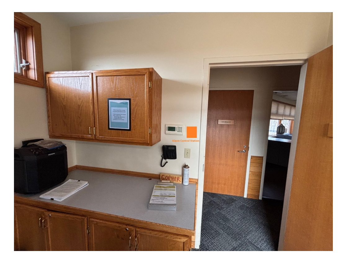
Figure 5 - Office Area Showing Alarm Control Station Placement Location