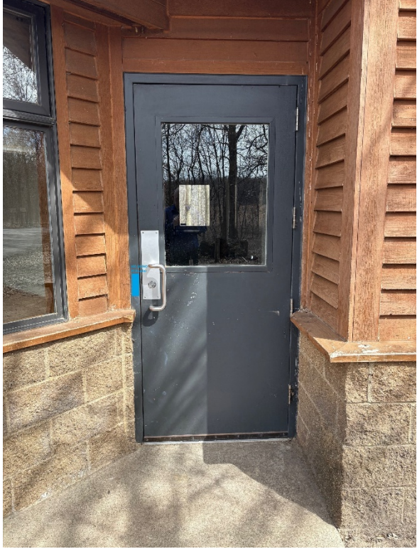
Figure 2 - Side Entry Door Showing Reader Location