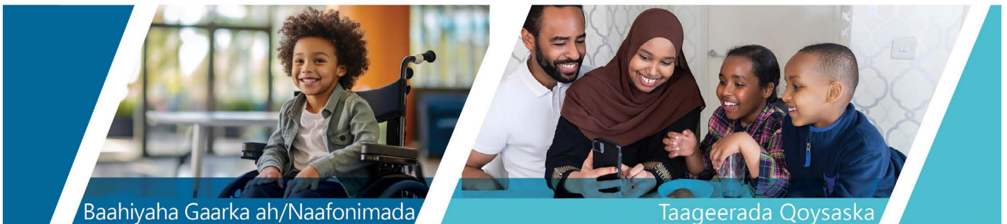
Baahiyaha Gaarka ah/Naafonimada