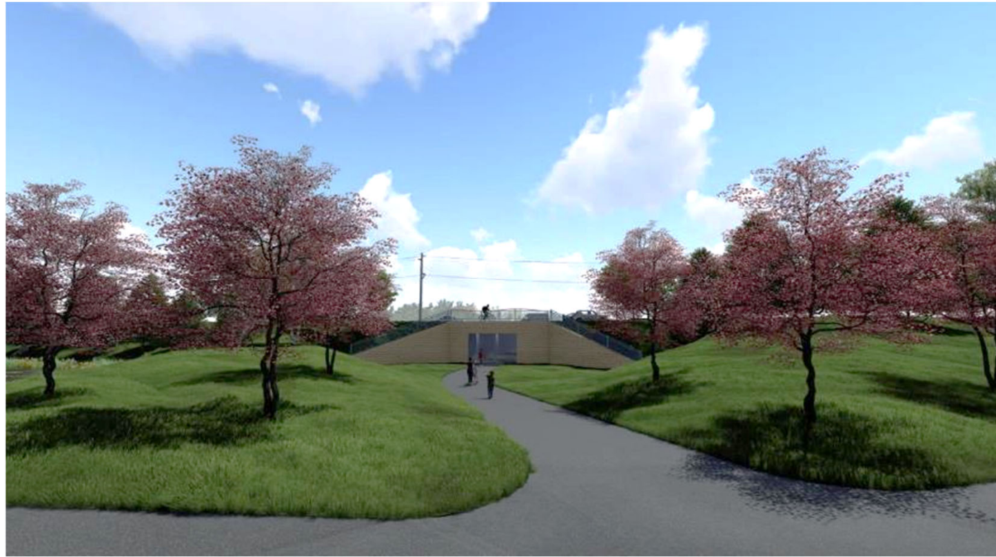
Rendering of trail and underpass looking north