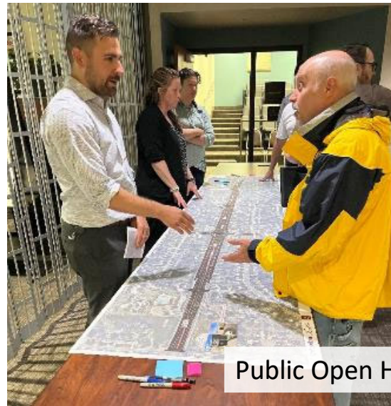
Public Open House (June 2024)