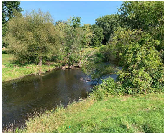
Image from the Vermillion Greenway-Hastings Segment 2023 Natural Resource Management Plan