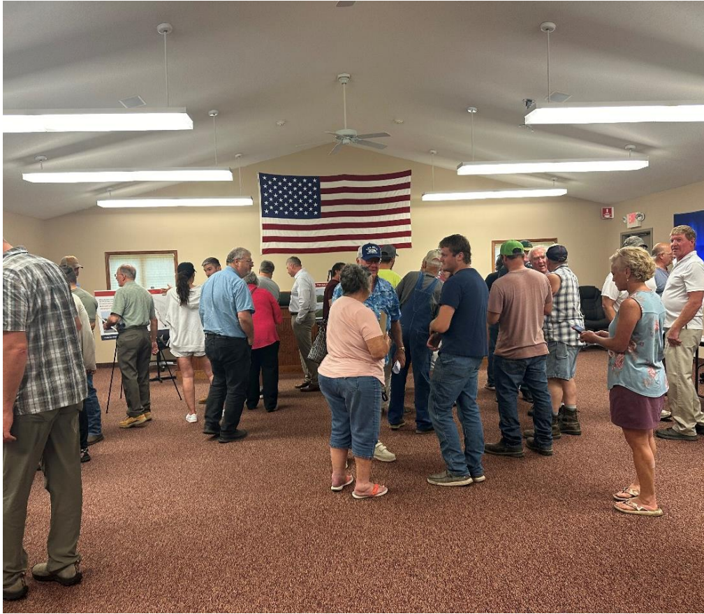
Figure 2 Image of open house attendees viewing project information boards