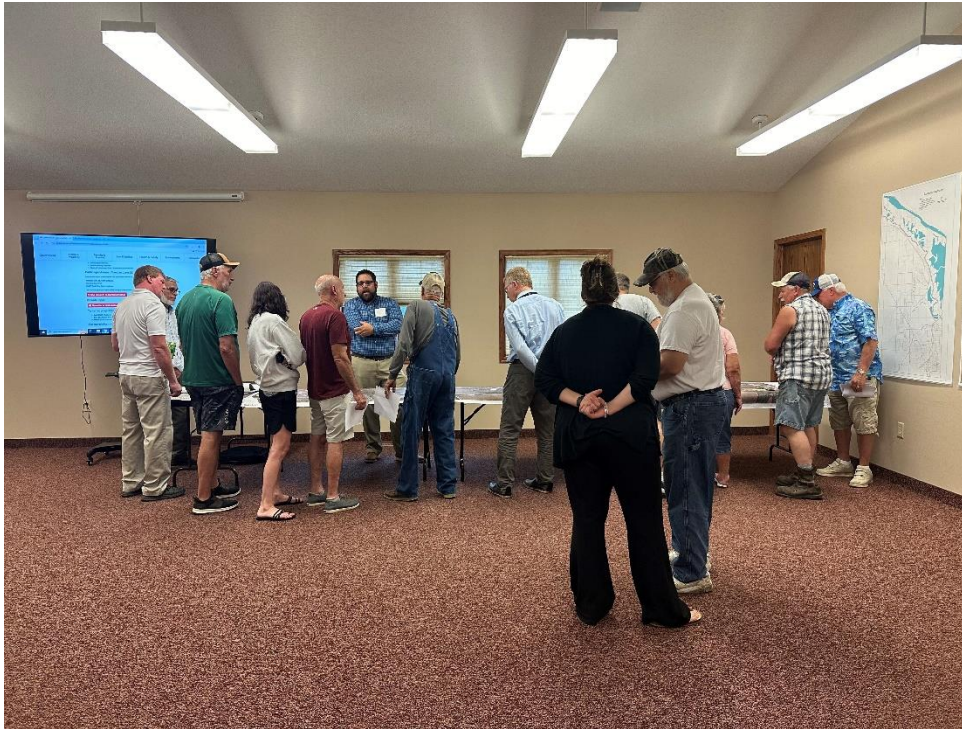
Figure 1: Image of open house attendees viewing project design layouts with staff