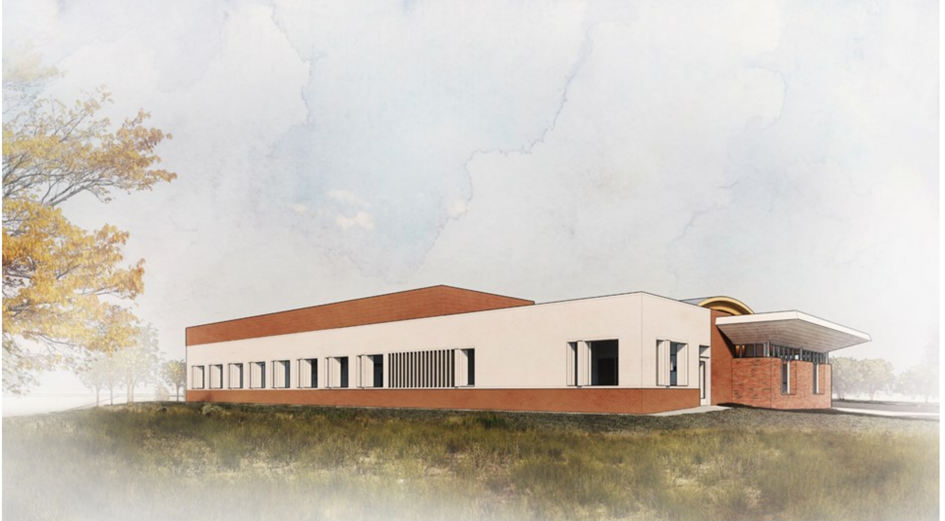
A. VIEW FROM SOUTHEAST