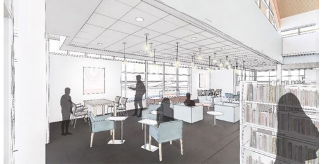
D. LIVING ROOM VIEW