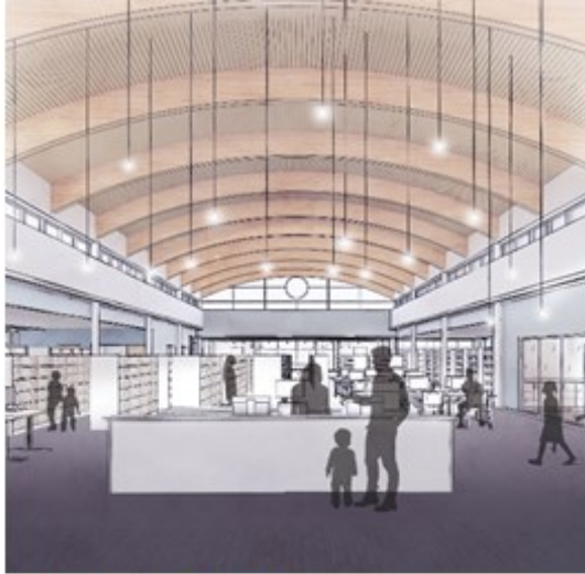
C. MAIN LIBRARY VIEW