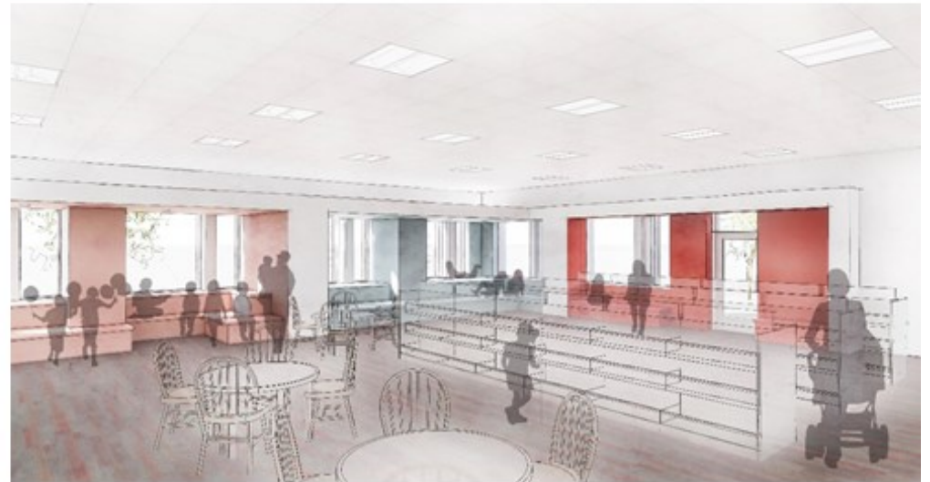
F. CHILDREN'S AREA VIEW