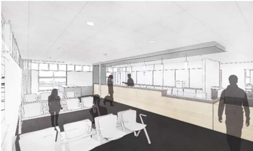
E. LICENSE CENTER VIEW