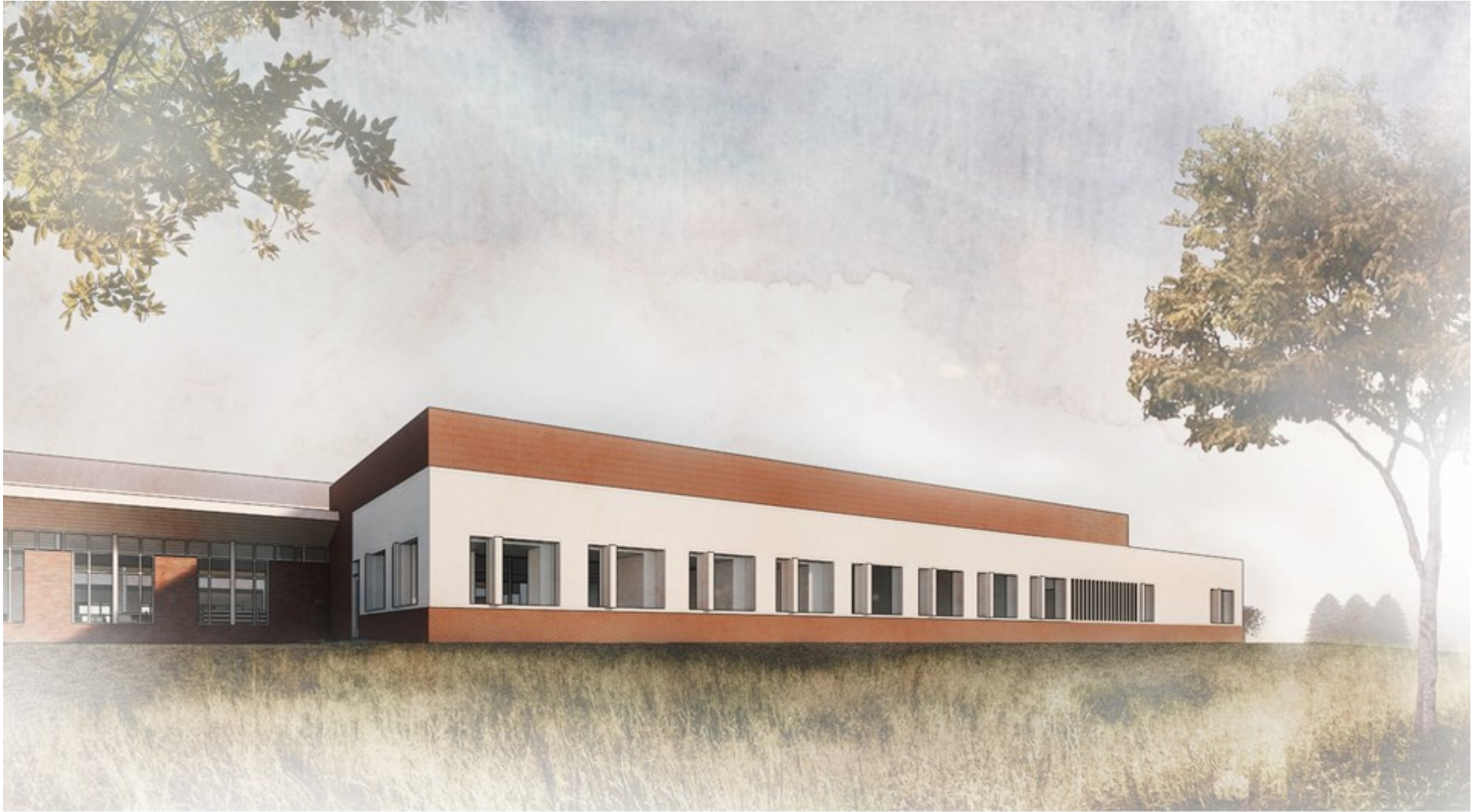
A. VIEW FROM SOUTHWEST