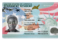
Permanent Resident Card (Green Card)

Student & Parent(s)/Legal Guardian(s) 2023 1040 Tax Return Form OR W-2s