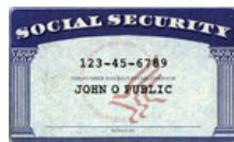
Social Security Number

Social Security Number OR Permanent Resident Card (Green Card)