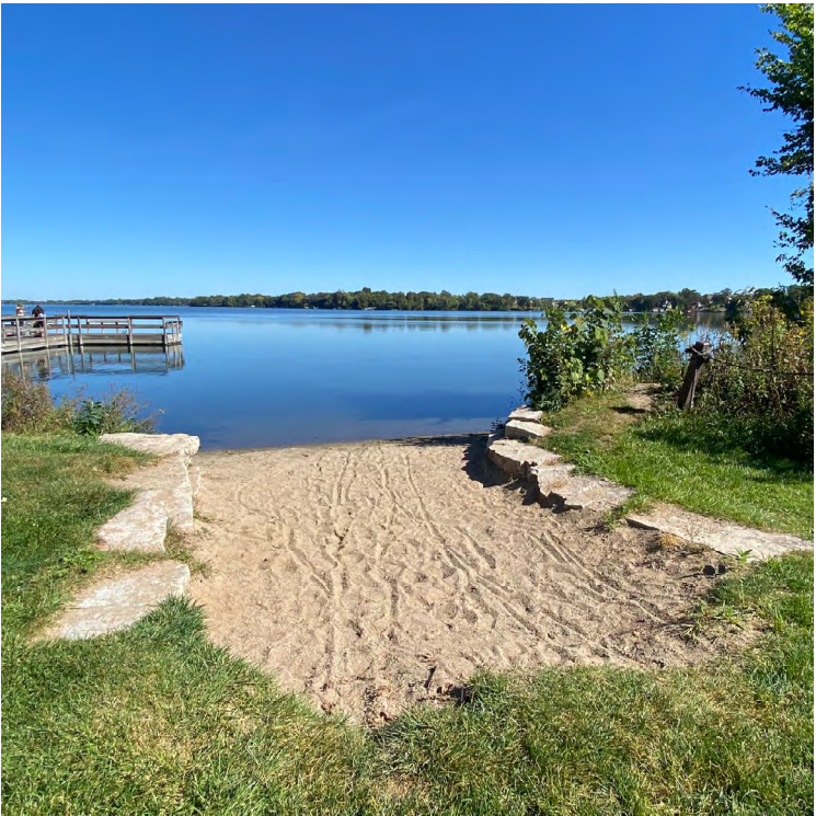
NON-MOTORIZED WATERCRAFT LAUNCH