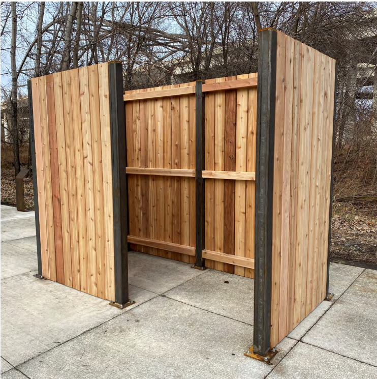
PORTABLE RESTROOM ENCLOSURE