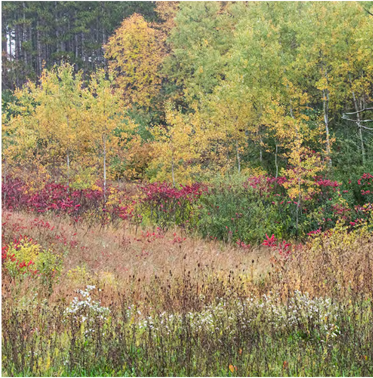
FLOOD ADAPTIVE / RESILIENT LANDSCAPE