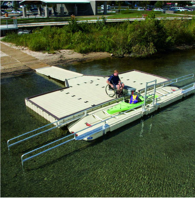
ACCESSIBLE EZ DOCK