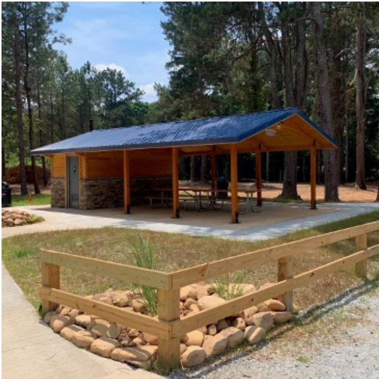
PARK PAVILION / STORAGE SPACE (24'X36')