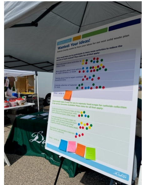
Burnsville Farmers Market