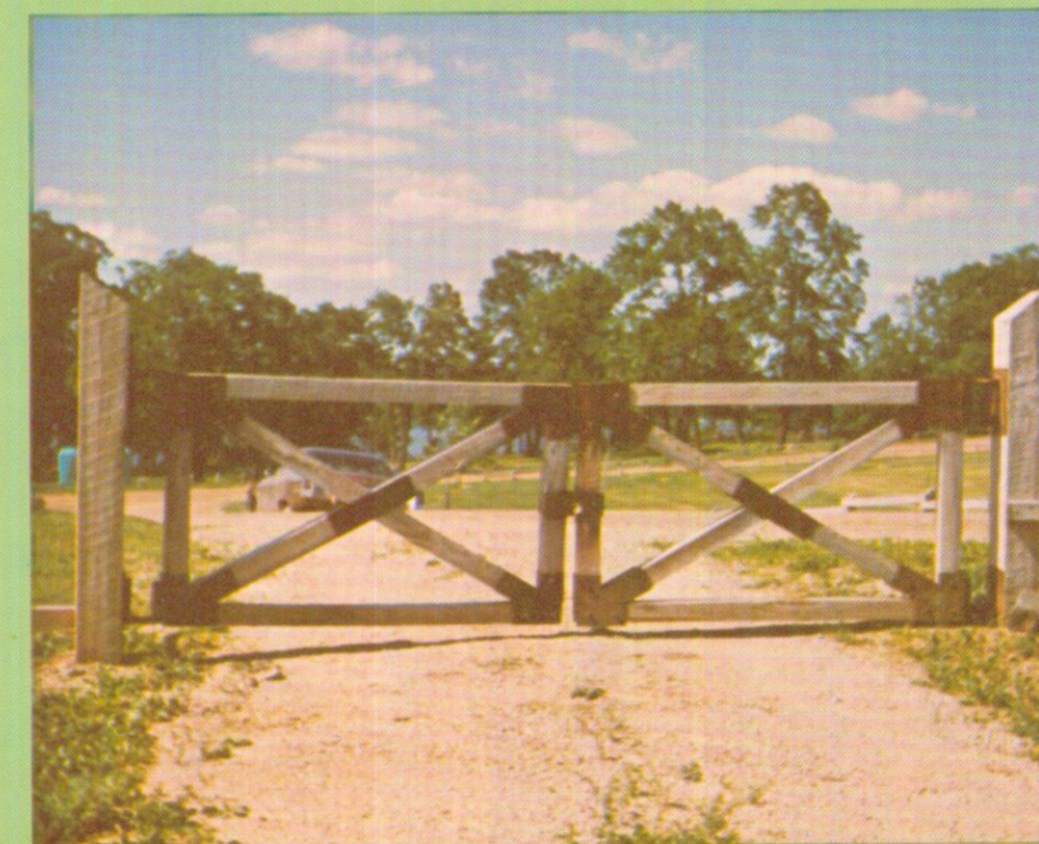
SMALL SECURITY GATE