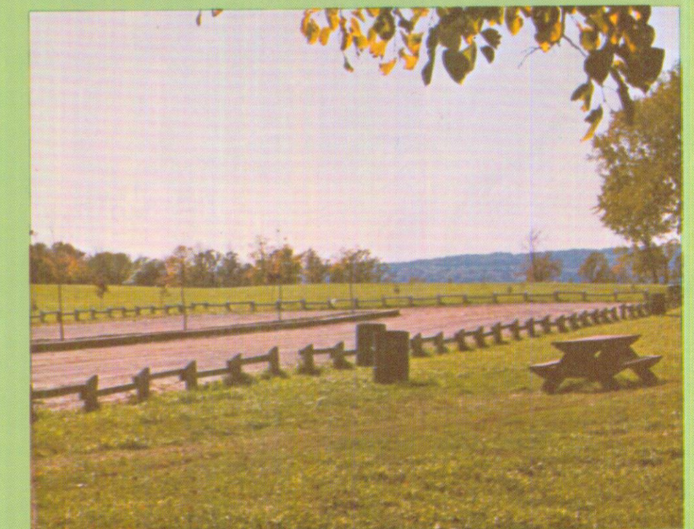
PARKING LOT PERIMETER FENCE