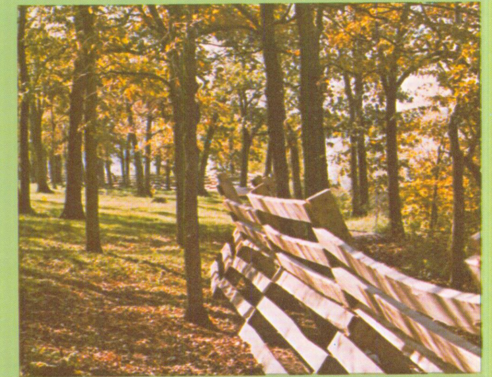
FREESTANDING SCENIC FENCE