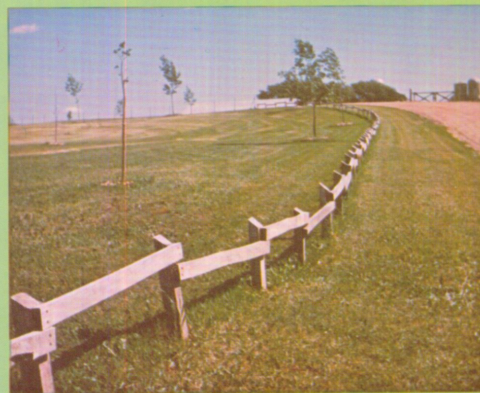
ROADSIDE PERIMETER FENCE

The pictures to the right portray the efforts being taken by the Dakota County Parks Department to fight Dutch Elm disease while simultaneously producing a useable product which would otherwise be wasted.