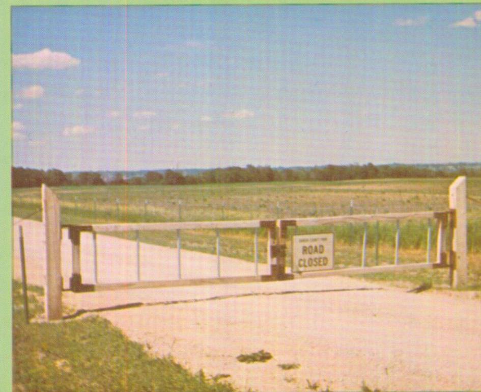
LARGE SECURITY GATE - Steel Reinforced