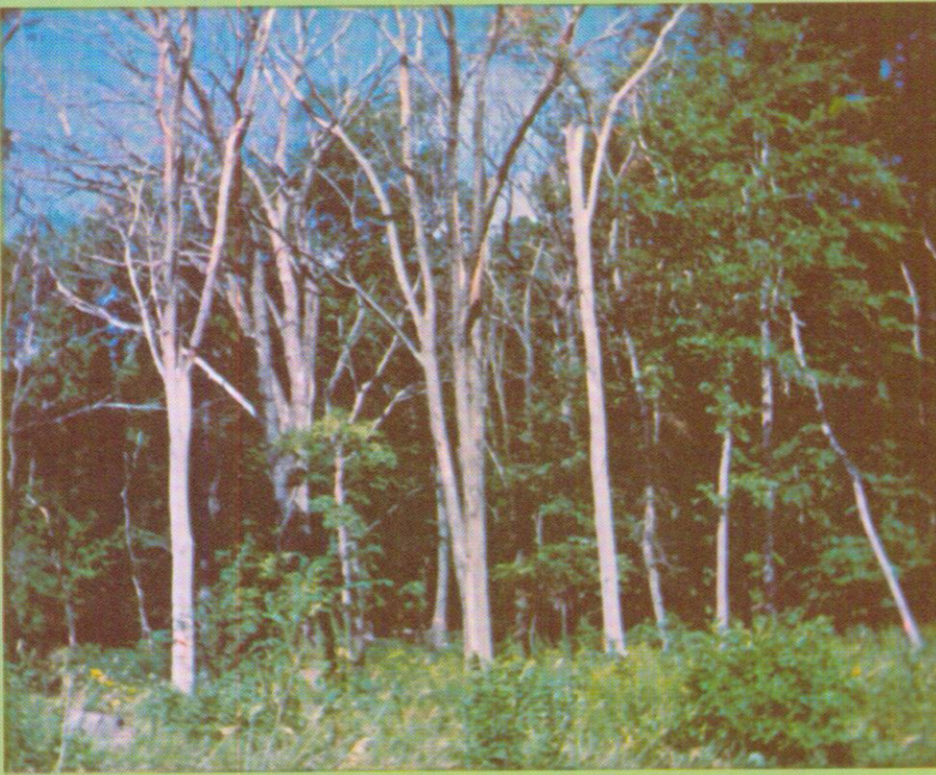
AMERICAN ELMS - Destroyed By Dutch Elm Disease