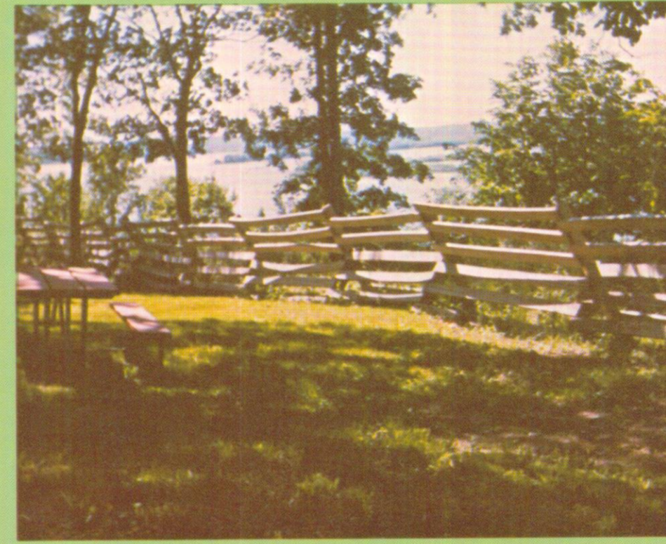
FREESTANDING SCENIC FENCE