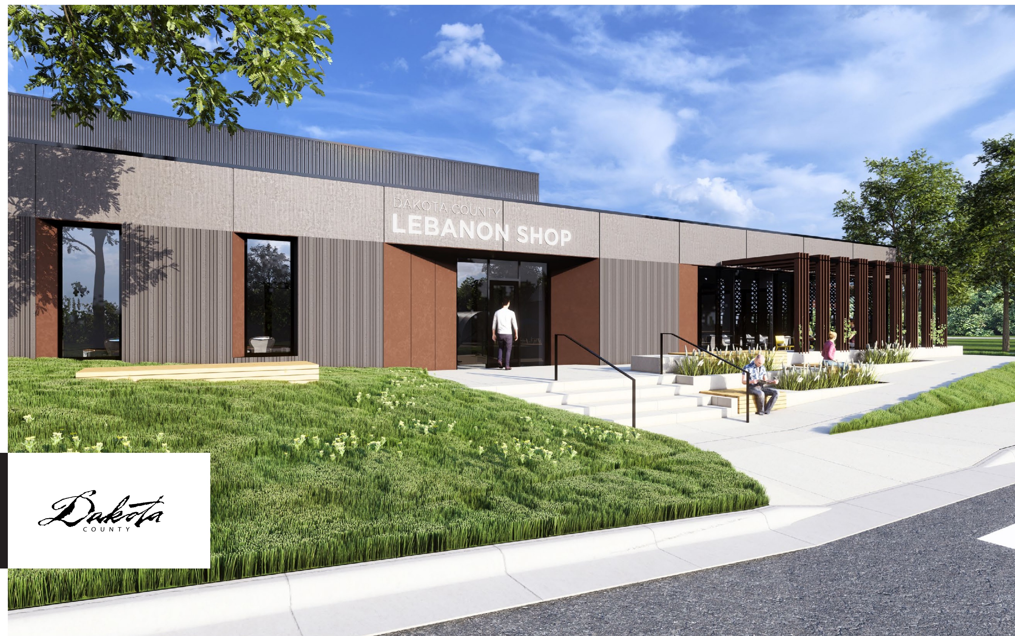
VIEW AT ENTRY