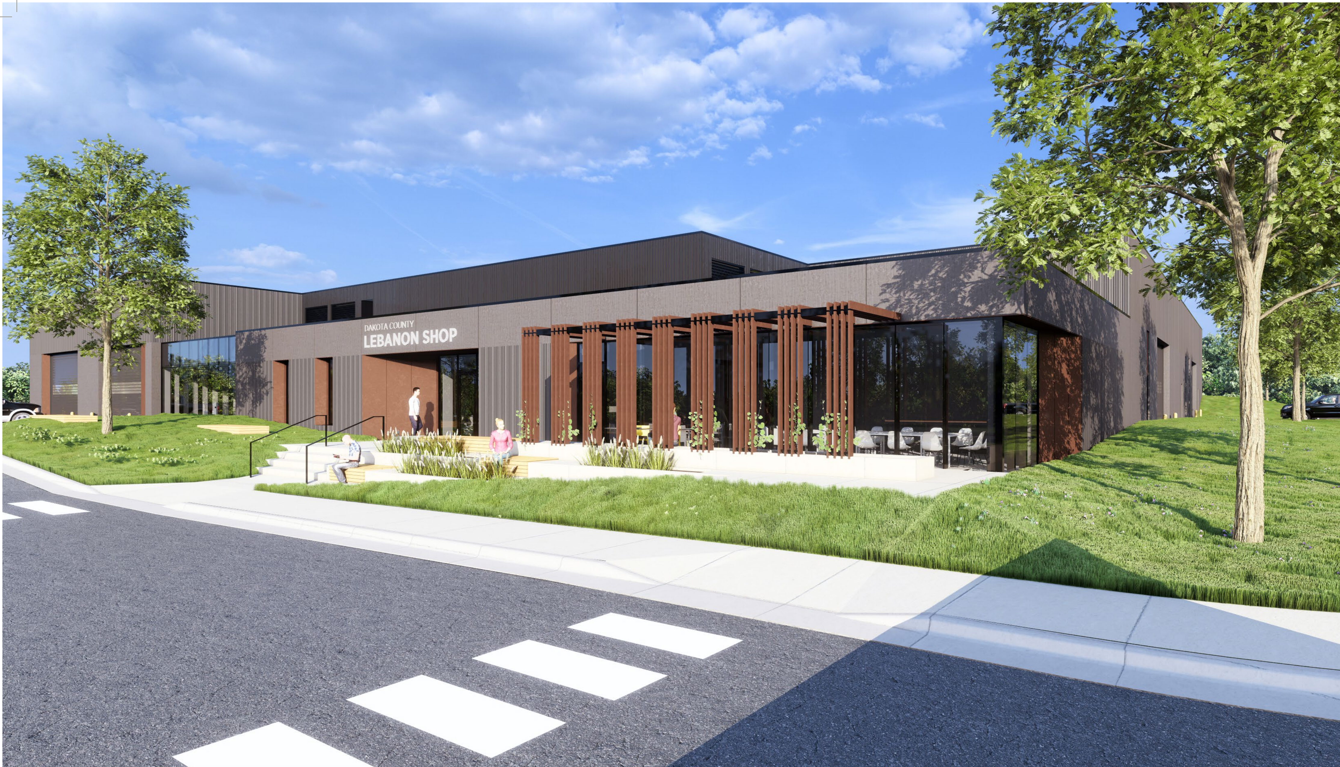
VIEW FROM SOUTHWEST