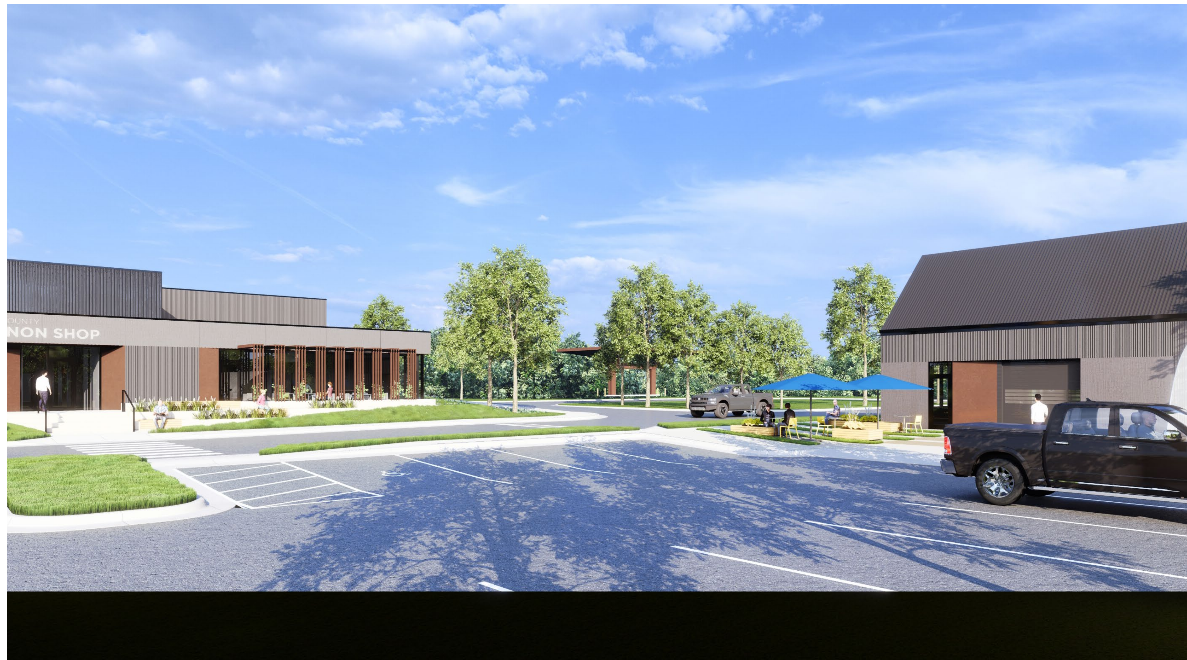
VIEW FROM PARKING AREA